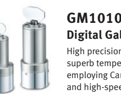
GM1010/GM1015 Digital Galvano Scanners

KrF photolithography system supports high-volume manufacturing of semiconductor devices. The ES6a scanning stepper utilizes Canon's Advanced Flexible Illumination System (AFIS) to resolve 90 nanometer features.